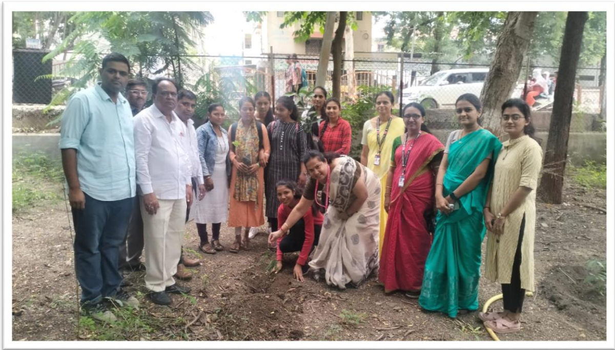
Honourable Principal Planting a tree