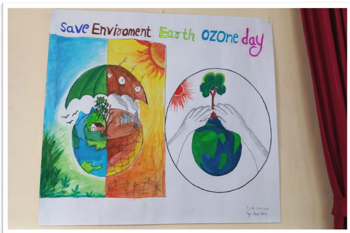
Rangoli competition on “Ozone Day”