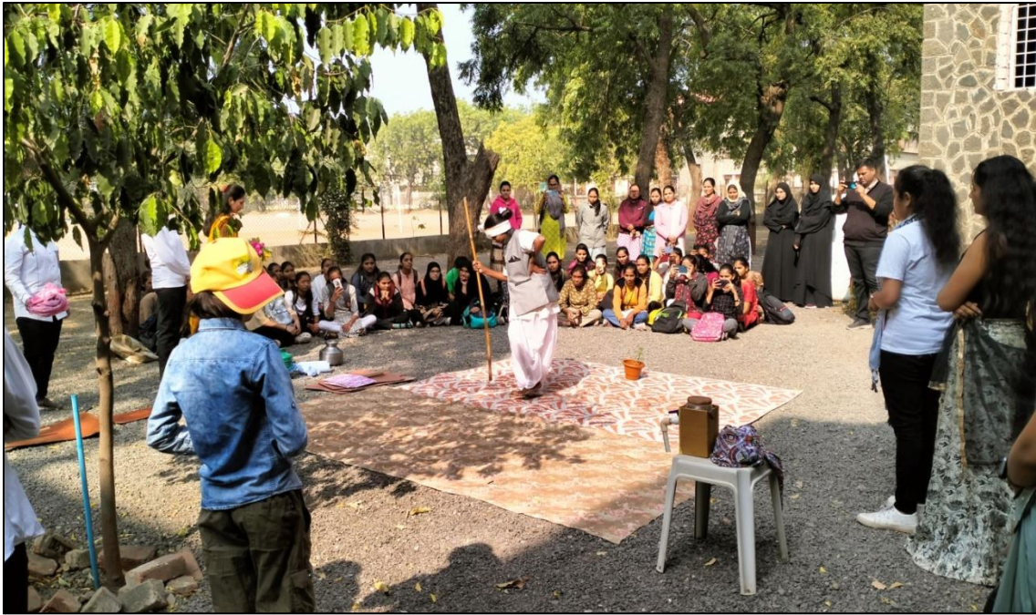
Students performing street play